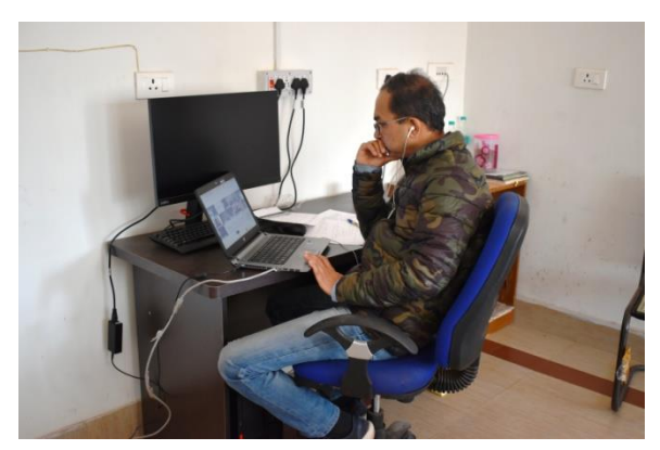
Glimpses of the Seminar