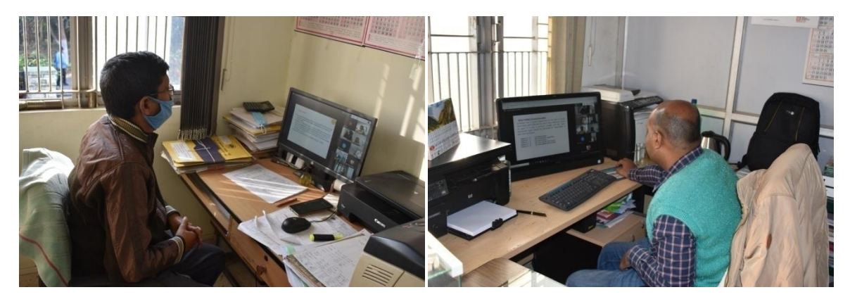
Glimpses of the Seminar